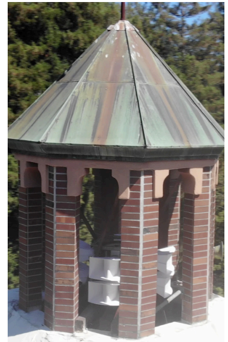
MILL VALLEY CITY HALL INSTALLATION

Self-contained or easily integrated with existing infrastructure, and featuring solar power, battery backup and satellite connectivity, Genasys systems are highly effective in delivering critical communications and life-saving notifications before, during and after wildfires, floods, tornadoes, hurricanes, earthquakes, tsunamis and other disaster and crisis situations.