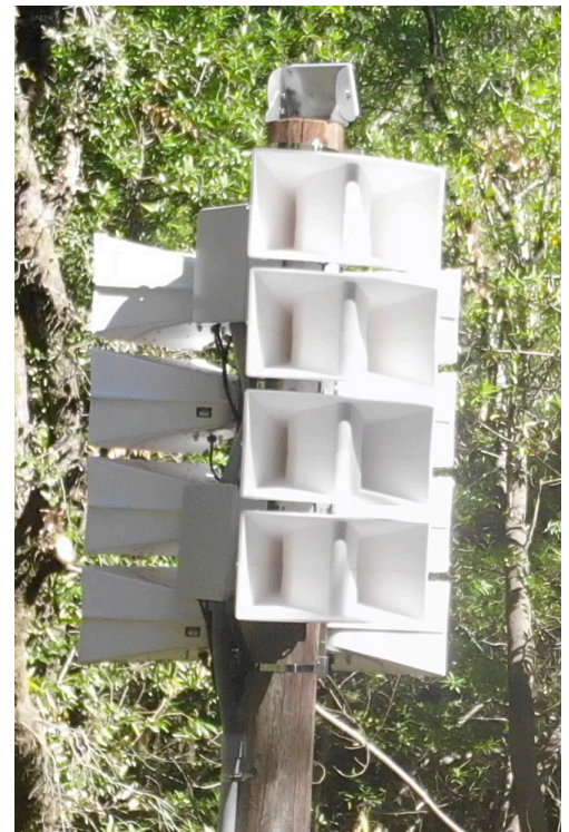
GENASYS VOICE SIREN - CASCADE SPRINGS INSTALLATION

After evaluating and testing several systems, city officials selected the industry-leading area coverage, vocal clarity, and connectivity options of Genasys' emergency warning voice notification systems. James Wickham, mayor of Mill Valley, commented on social media, "The City of Mill Valley is excited to announce the installation of new and more powerful emergency sirens to replace our aging system. These sirens project both siren and voice recordings to alert and inform the community."